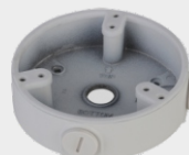
PFA137 Junction Box