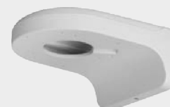
PFB203W Wall Mount