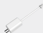
LR1002 Mount Adapter