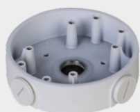
PFA139 Junction Box