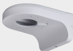
PFB204W Wall Mount